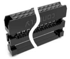
(Series Image-Reference Only)